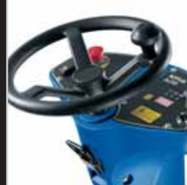
Adjustable steering wheel for excellent operator comfort